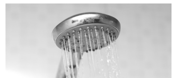
Reduce showering time

Find more tips at savingwater.org/indoors