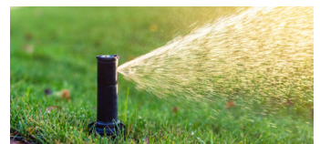
Water before 8 a.m. (best) or after 7 p.m.