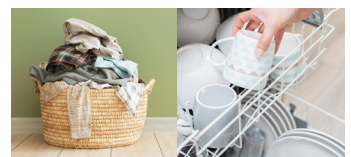
Wash only full loads

Find more tips at savingwater.org/businesses