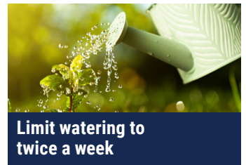
Limit watering to twice a week

Find more tips at savingwater.org/lawn-garden