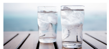
Serve water only on request