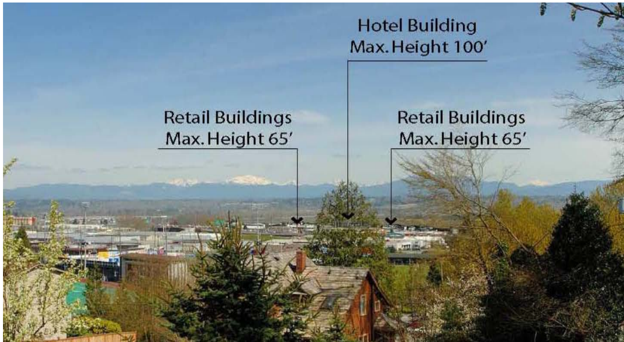
Top Photo: Currently permitted building height view impact