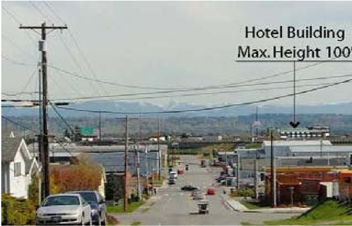
Top Photo: Currently permitted building height view impact