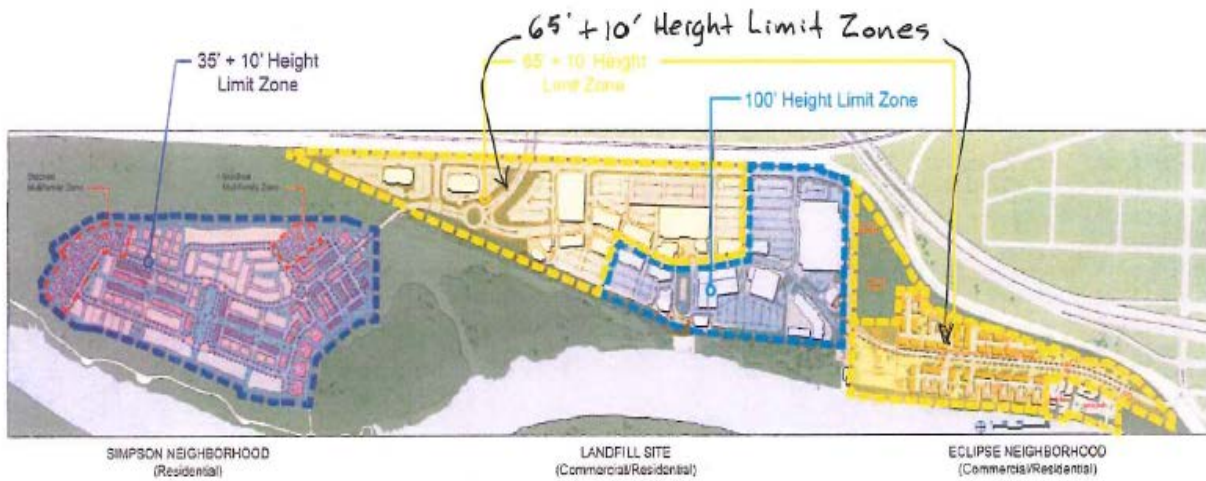
Top: Currently permitted building heights for Riverfront Redevelopment