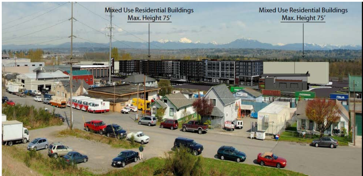
Bottom Photo: Proposed maximum permitted building height view impact