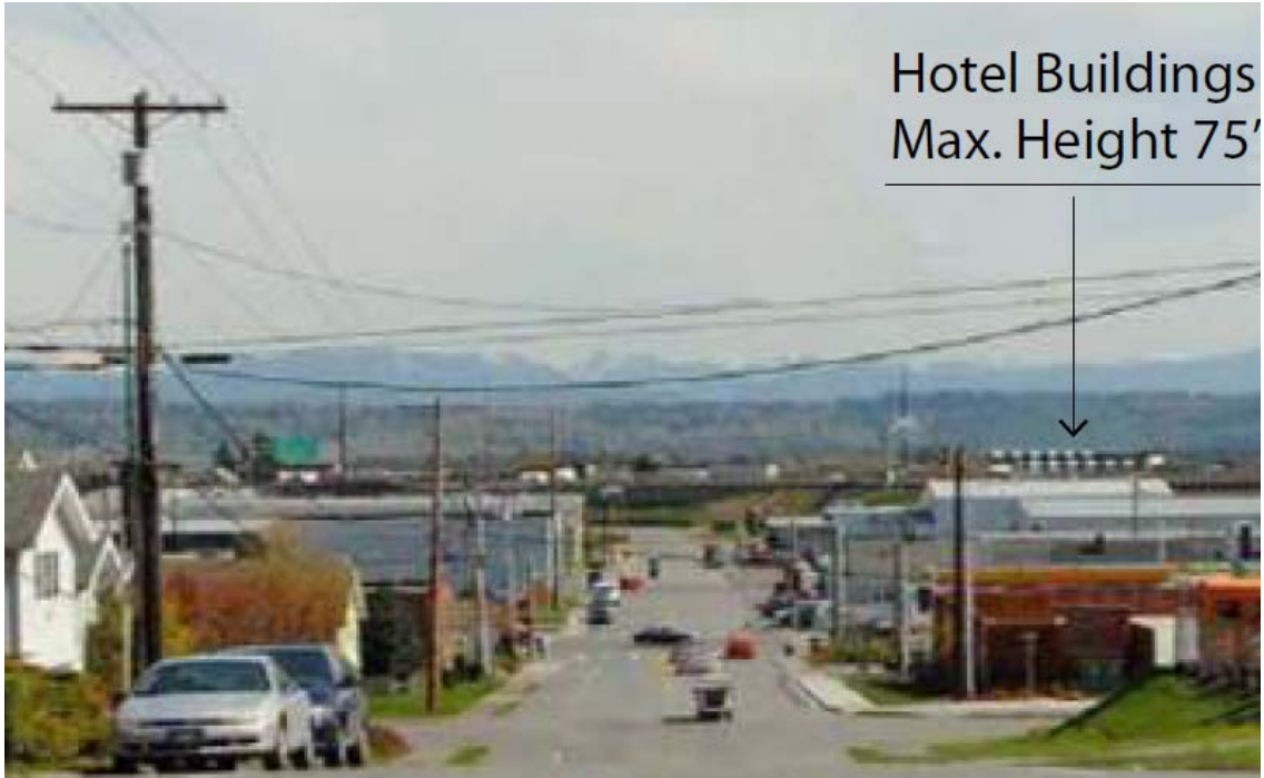
Bottom Photo: Proposed maximum permitted building height view impact