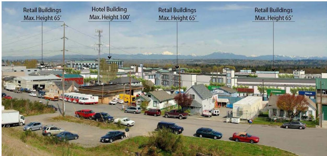
Top Photo: Currently permitted building height view impact