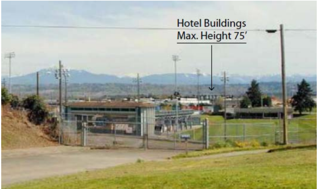
Bottom Photo: Proposed maximum permitted building height view impact