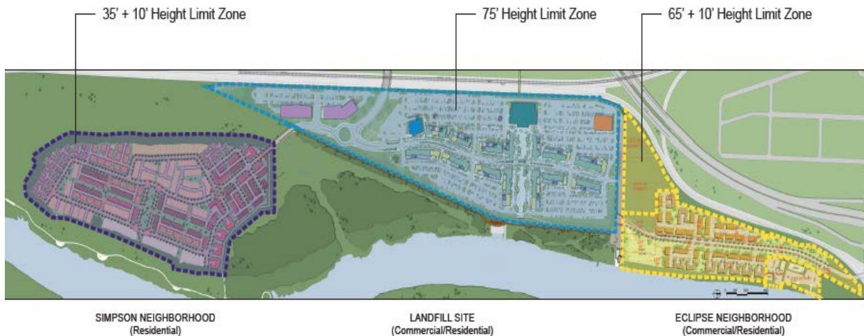
Bottom: Proposed permitted building heights for Riverfront Redevelopment

Changes in permitted height on the Landfill Site: