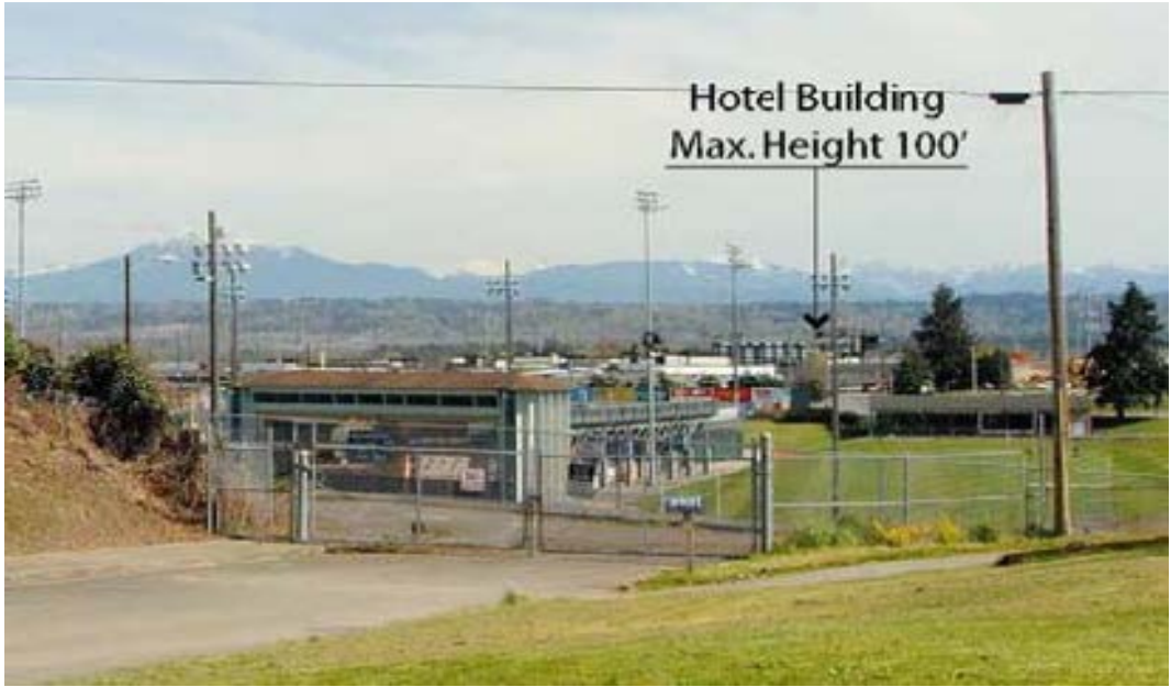
Top Photo: Currently permitted building height view impact