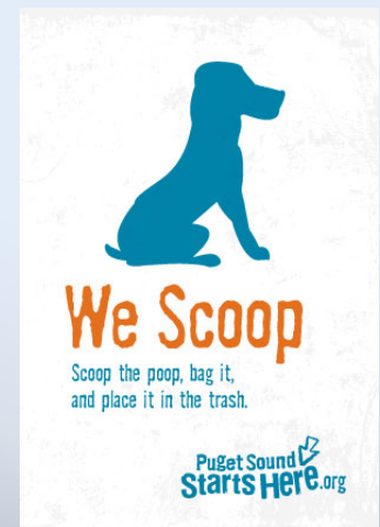
Sticker for pet waste receptacles.

Roundworm, E. coli and giardia are just a few of the harmful microorganisms found in pet waste that can be transmitted from pet waste to humans. Some of these microorganisms can survive as long as four years in the yard.